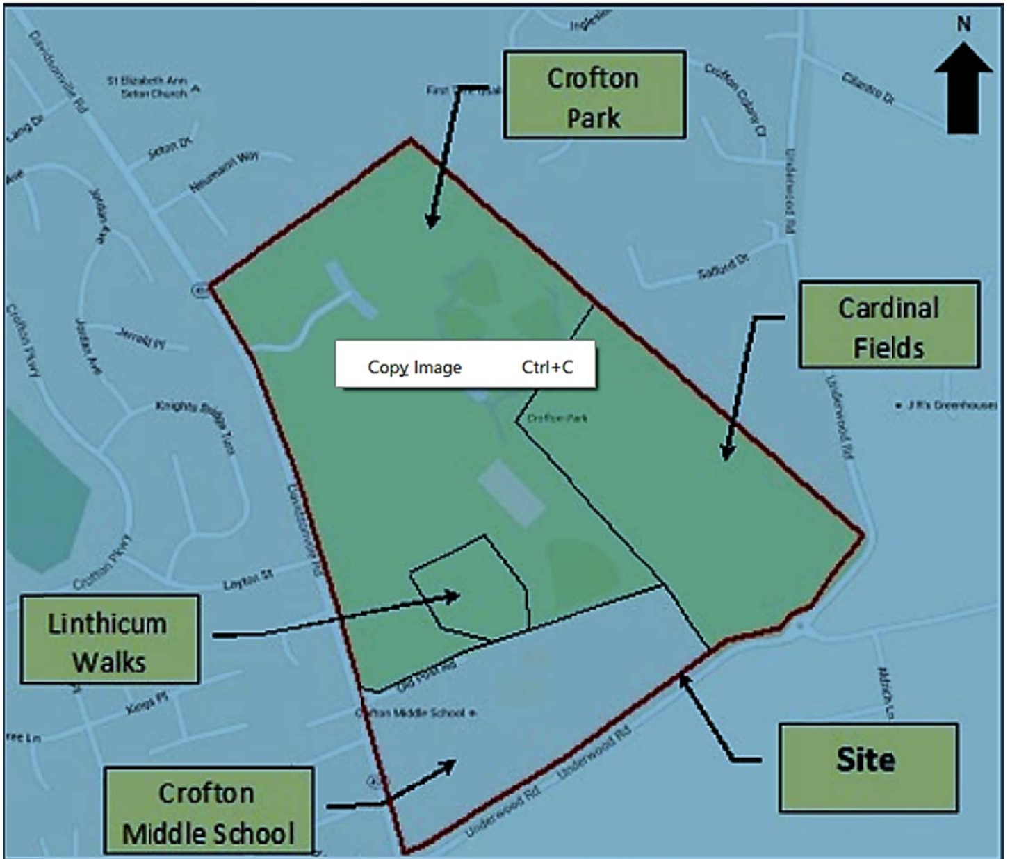
Figure 1: New Crofton High School site