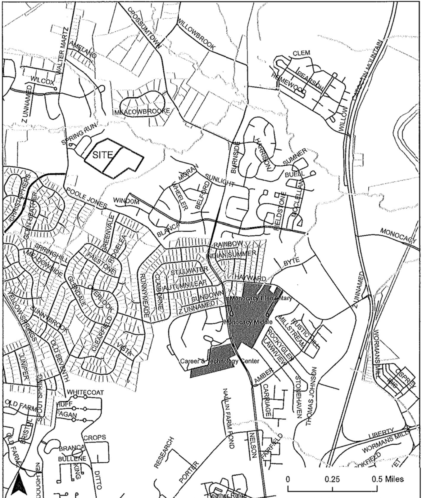
Figure 1: Vicinity Map - North Frederick City Area Elementary School