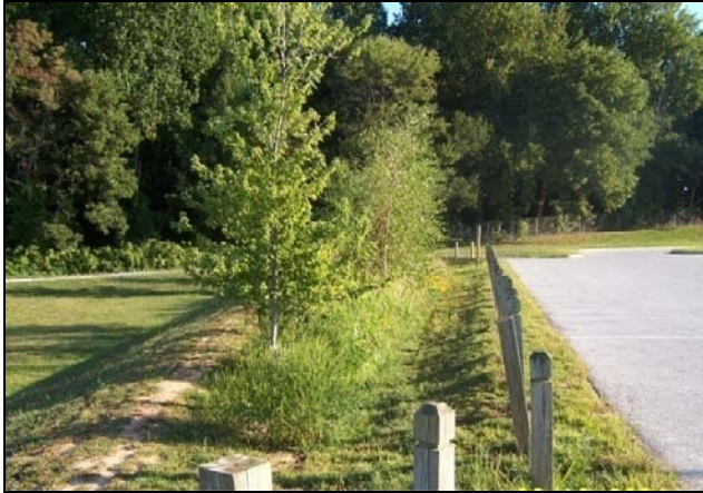
Two years after construction