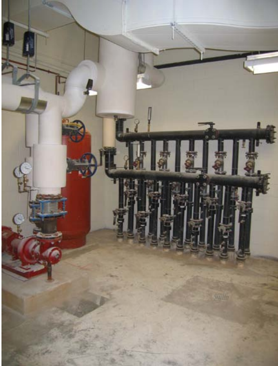
Mechanical Room, Geothermal Ground Source Heating and Cooling System Great Seneca Creek Elementary, Montgomery County

General 21 school systems have implemented geothermal ground source heating and cooling systems at 74 schools, including at this writing 38 in operation, 16 in construction, and 20 in design.