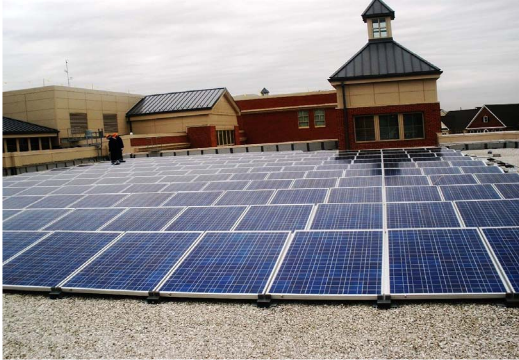
Lakelands Park MS roof in Montgomery County, part of a 133 KW solar PV system, 770 panels; installed under a power purchase agreement in 2008