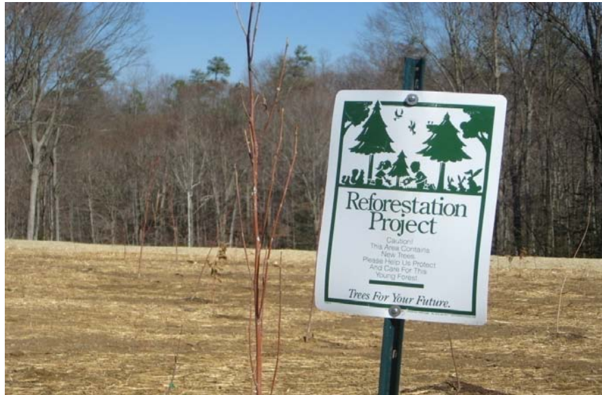
Reforestation Barstow Elementary School, Prince Frederick, Calvert County