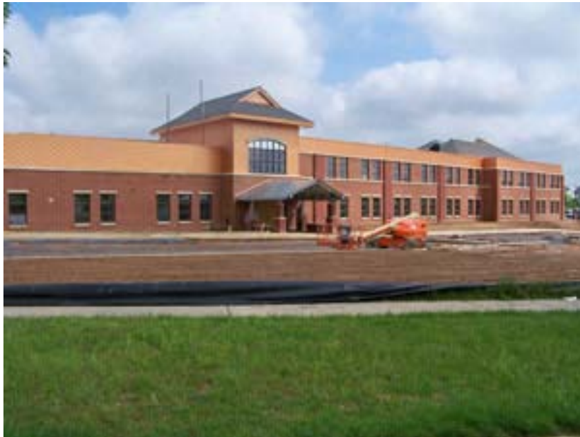
William B. Gibbs Elementary School - LEED certification pending Montgomery County Public Schools