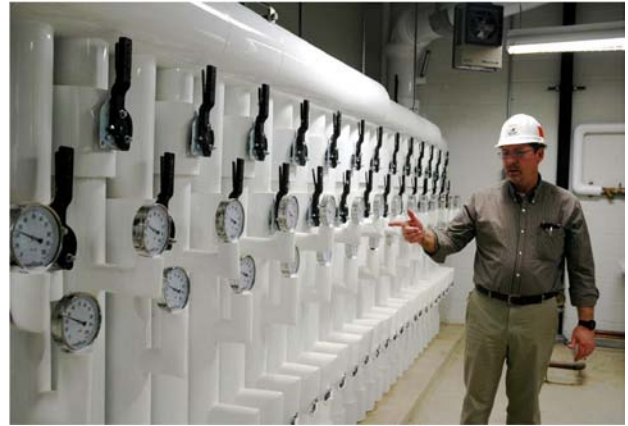
Mechanical Room, Geothermal Ground Source Heating and Cooling System St. Michael's Elementary and High, St. Michael's, Talbot County

Allegany Fort Hill High School received grants to install a 1 kw photovoltaic solar generator. The system has been integrated into the school's environmental science curriculum