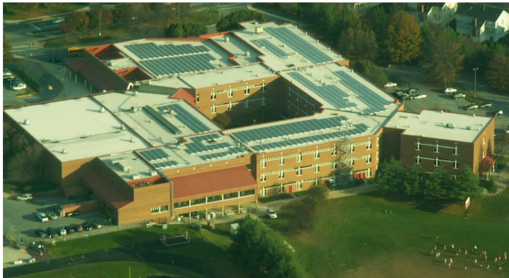
Quince Orchard High School, located in Gaithersburg, MD - hosting a 319 KW photovoltaic system, 1799 PV panels; installed under a purchased power agreement in 2009