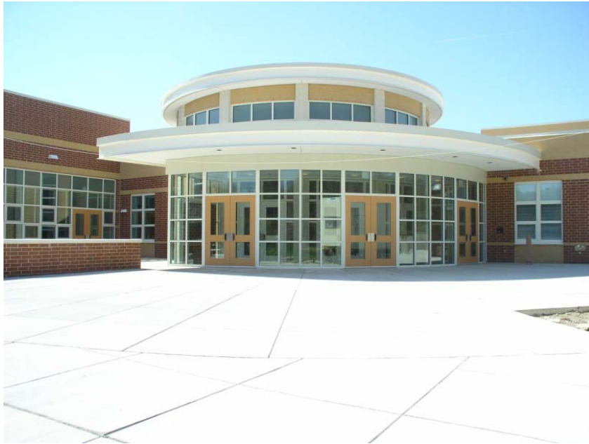
Francis Scott Key Middle School – Certified LEED Gold Montgomery County Public Schools