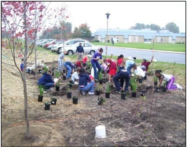
Burleigh Manor Middle School, Howard County 7 th Graders Planting a Bioretention Area