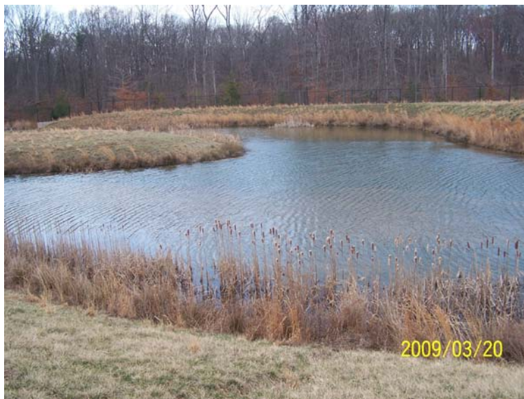
Stormwater pond North Point High School, Waldorf, Charles County