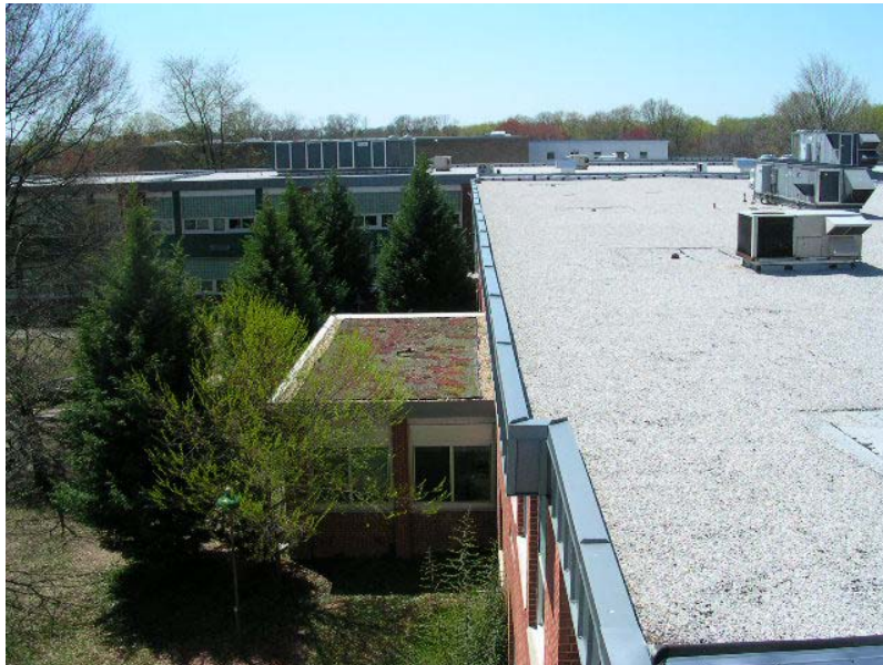
Demonstration green roof Northwood High School, Silver Spring, Montgomery County