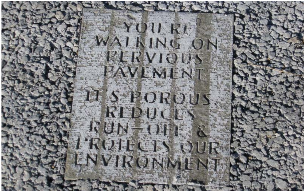
Pervious Pavement Linganore High School, Frederick County