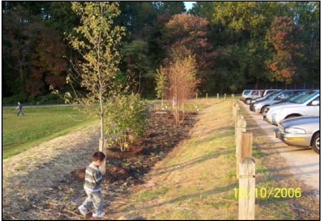
Immediately after Planning