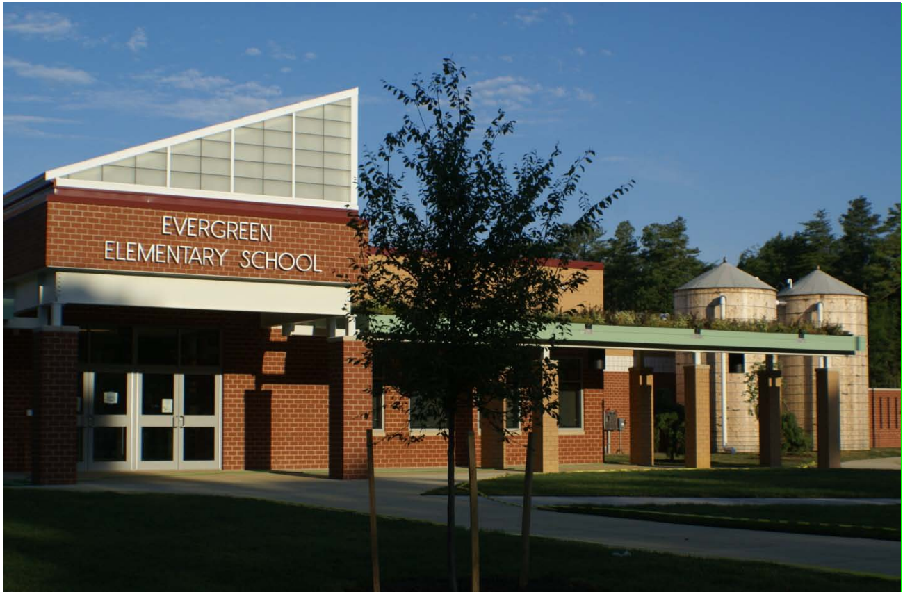
Evergreen Elementary School, St. Mary's County LEED Gold School