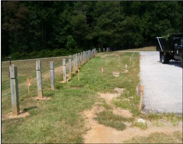
Prior to Construction

Howard Partnered with Howard County Department of Public Works in upgraded bioretention facilities to enhance the quality of storm water runoff.