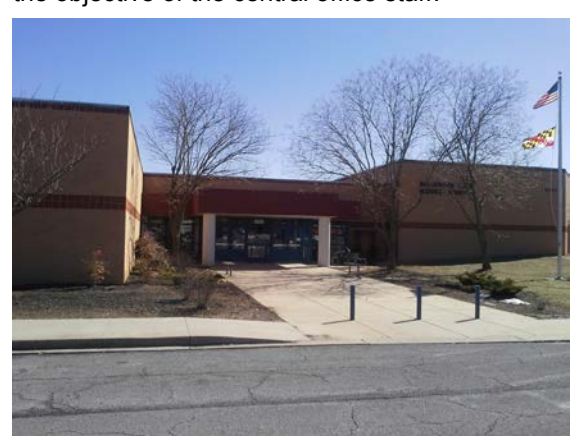
Ballenger Creek Middle

administrative oversight and to training provided to teachers and school-based building managers. We recommend that this become an area of focus for the Board of Education and Superintendent, so that the routine, daily condition of all schools will correspond to the high level of maintenance that is the objective of the central office staff.