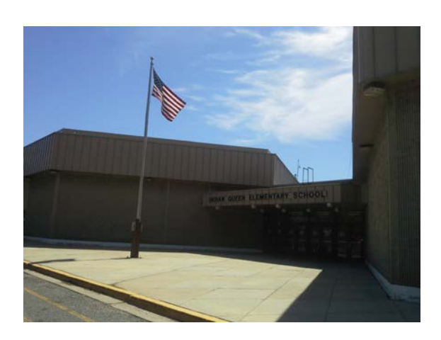
Indian Queen Elementary

note improvements in a substantial number of schools: Charles Carroll Middle, Flintstone Elementary, Hyattsville Elementary, James H. Harrison Elementary, Ridgecrest Elementary, Tanglewood Regional, Woodmore Elementary, and Capitol Heights Elementary, the school that was rated at Not Adequate in FY 2013. Often, this progress is attributed to the diligence and care applied by the principal and the schoolbased personnel. Many of the deficiencies identified this year will be improved, as sixteen of the schools inspected are scheduled to receive projects which have been approved in the State-funded CIP. In combination with the expanded capital investment program that has been developed recently, we anticipate that further progress will be made in reducing maintenance deficiencies throughout the school system.