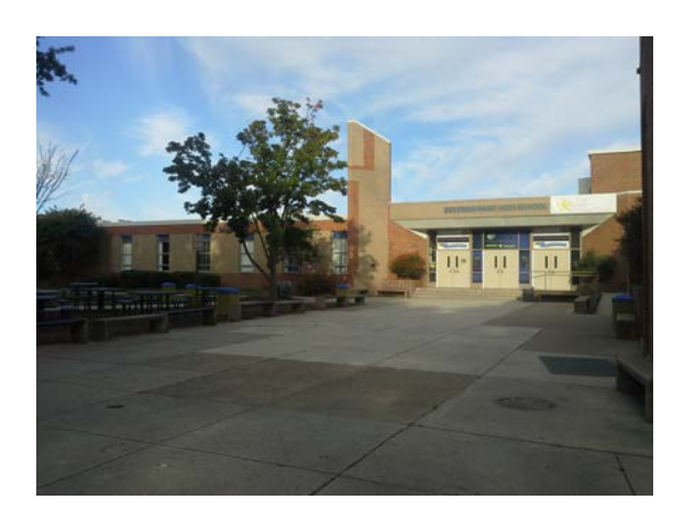
Severna Park High

The highly professional and well-prioritized capital program that Anne Arundel County Public Schools has implemented over several decades has corrected many deficiencies in its older portfolio of schools. It nevertheless appears that attention must be paid to retaining the value of its facilities through an aggressive program of preventive and corrective maintenance, as well as thorough training of in-school staff in factors that affect the routine safety and overall quality of the school.