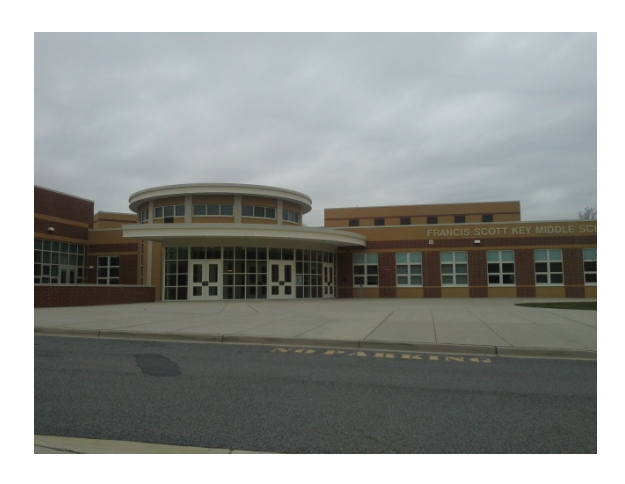
Francis Scott Key Middle

systems had not been properly maintained or certified as required by NFPA. Other areas of concern include the electrical distribution systems and the HVAC control systems. Aged systems can be upgraded or replaced through the capital program, but these systems also benefit from regular testing to ensure proper performance.