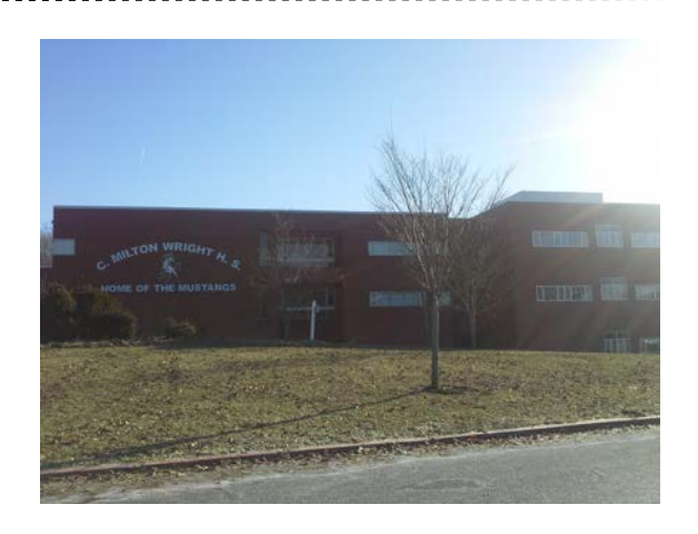
C. Milton Wright High

The IAC inspectors found that focused attention should be applied throughout to replacement of ceiling tile when it is damaged or stained, installation of ground fault interrupt (GFI) outlets in areas near sources of water, organization of storage in equipment rooms, and improvements to interior lighting. Given the advanced age of some of the schools, providing a reliable and robust budget to address these many maintenance needs is an important obligation of the board of education and the local government. At the same time, the capital renewal budget of Harford County Public Schools has for several years not been consonant with the number of school buildings or their age, as compared to the capital budgets of other mid-size jurisdictions in the state. If this trend persists, the school system will face an increasing number of building components in inadequate or even failing condition, a situation that can be forestalled if a more robust level of investment is initiated with the upcoming capital cycle.