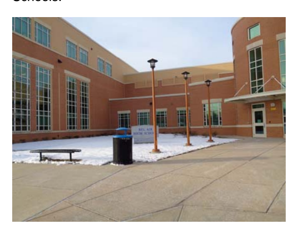
Bel Air High

Regardless of age, the interiors of all schools inspected this year are very well maintained by the onsite custodial teams. Based on past inspections, this appears to be a consistent trend throughout all Harford County Public Schools.