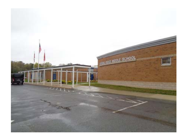
Spring Ridge Middle

Although St. Mary's County has the fifth highest average age of square footage in the state, it also has its share of older facilities as demonstrated in these four schools.