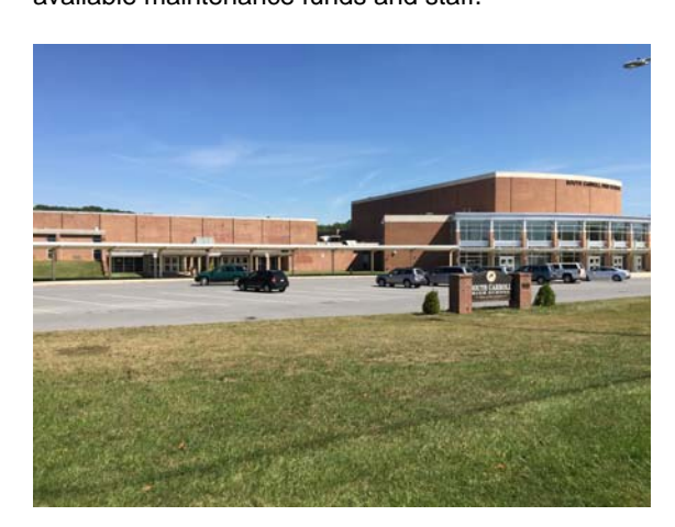
South Carroll High

Public Schools has recently made very difficult decisions regarding closing schools and redistricting but these changes will ultimately benefit the conditions of the remaining schools in terms of available maintenance funds and staff.