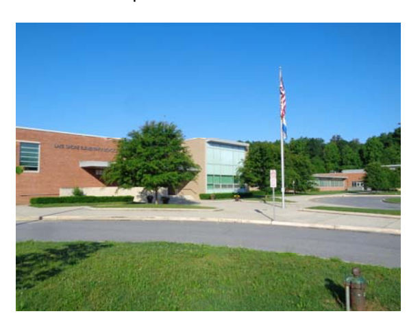
Lake Shore Elementary

To support AACPS extremely well-prioritized and managed capital improvement program, the following are recommended: upwardly resizing maintenance staff as new buildings come online, thorough and continuous training of all maintenance and facility staff, and proactive education of and coordination with administrative personnel in schools.