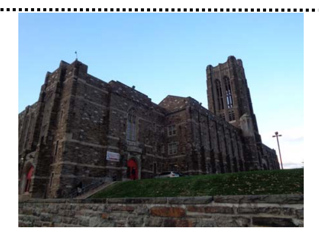
Baltimore City College #480

This objective is difficult but reasonable, particularly given the current unsatisfactory status of maintenance in City Schools. In every fiscal year FY