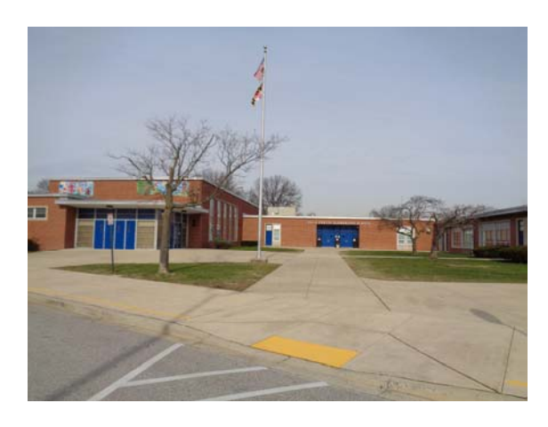
Villa Cresta Elementary

translates to the interior condition as a result of proper and safe utilization practices. Padonia International Elementary is a very nicely maintained school but has a condensate problem with piping that has resulted in ceiling stains in many locations.