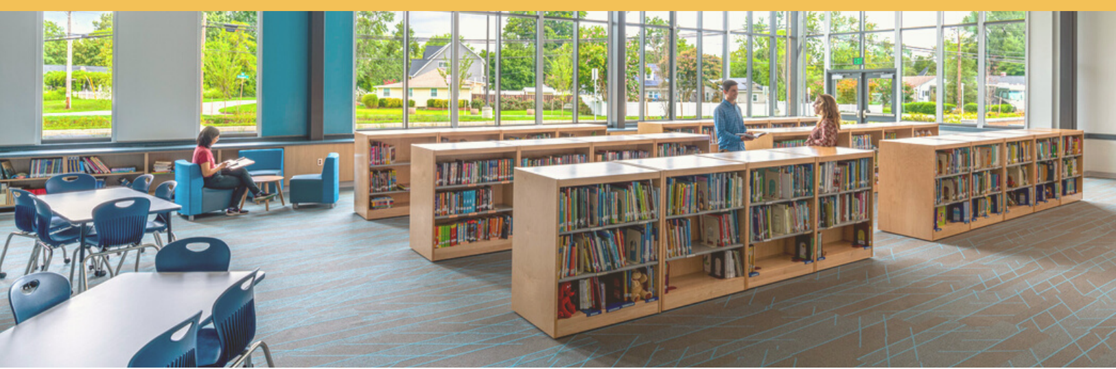
Edgewater Elementary, courtesy of Anne Arundel County Public Schools